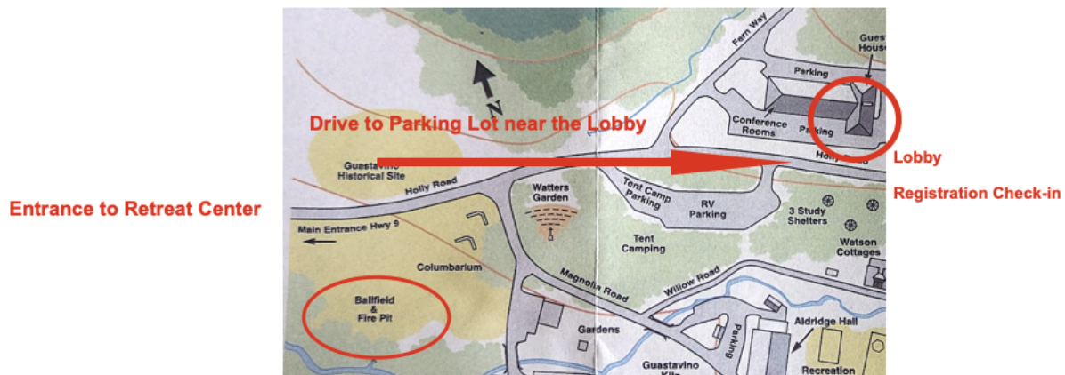
Parking in back for upper rooms

Directions: Follow your GPS to 222 Fern Way, Black Mountain, NC. After you turn toward the Christmount Entrance from NC Highway 9 stay on Holly Road past FernWay and go beyond the Guest House Lodge to enter the lower parking lot from the east side. Head to the front lobby of the Guest House to check in (look for the awning on the front of the building.)